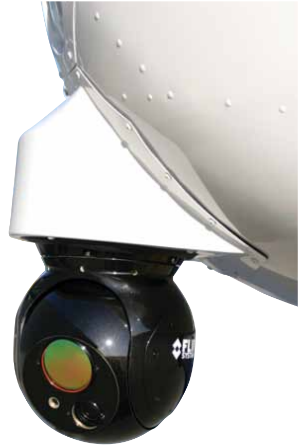
FLIR Ultra 8000 Thermal Imaging Camera.

A variety of optional equipment is available including: five-point shoulder harness system (front seats); P/A speaker and siren (100 watt); microwave downlink capability; LoJack; moving map systems; and a selection of UHF, VHF, and 800 MHz police radios.