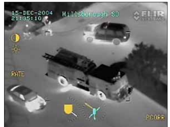
Image captured by the FLIR Ultra 8000.